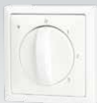
Multiple switch with filter indication

The multiple switch has a filter indication light. This light indicates when the filters require cleaning.